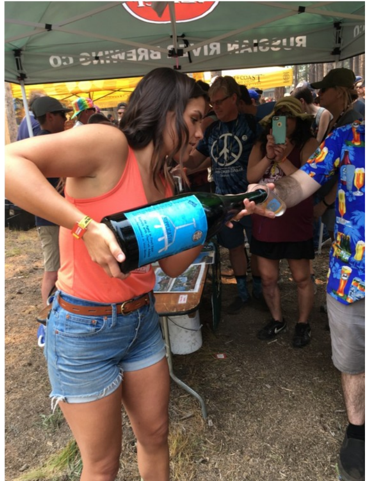
A giant magnum of two-year old Supplication, I'll take it!