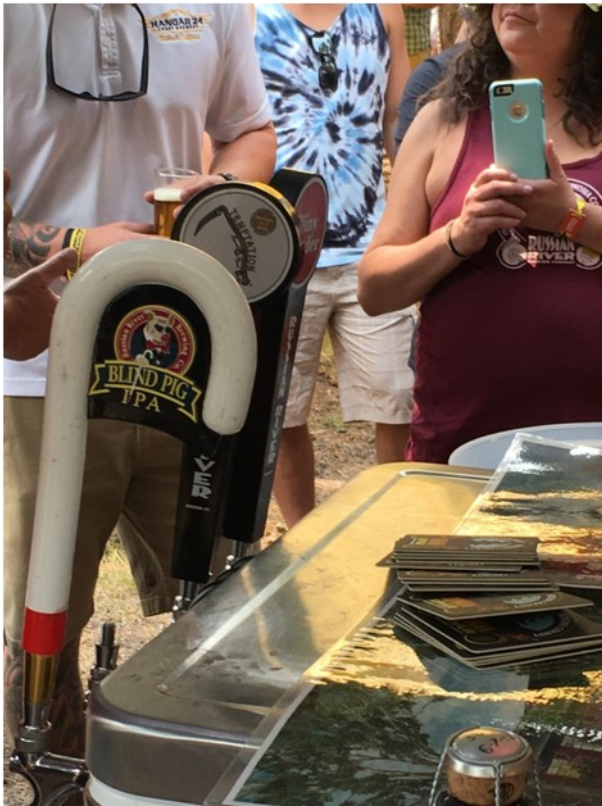
How do you beat a set of taps like that?

Finally, I just spent the previous weekend at one of my favorite beer festivals, the Mammoth Festival Beers and Bluesapalooza. If you haven't ever attended it's a multi-day mixture of great beer and amazing music amongst the pines in Mammoth Lakes, California. A terrific festival with multiple great breweries and some amazing live music.